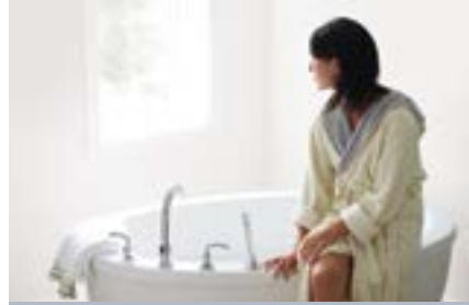
Water Heating Solutions

Through many years of innovation, including decades of commercial water heating experience, Rinnai has enhanced the way businesses operate, while creating a healthier way of living for their customers. With headquarters in Japan and a network of 20 subsidiaries and 86 sales offices in 13 countries, this commitment has made us the number one selling brand of tankless water heater systems. Dedicated to a smarter kind of comfort, our value-added products continue to stay in step with the demands of a changing world.