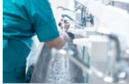
Commercial Water Heating Solutions