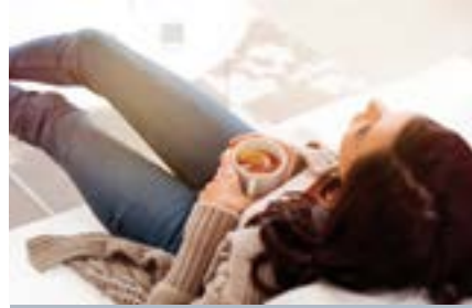
Home Heating Solutions